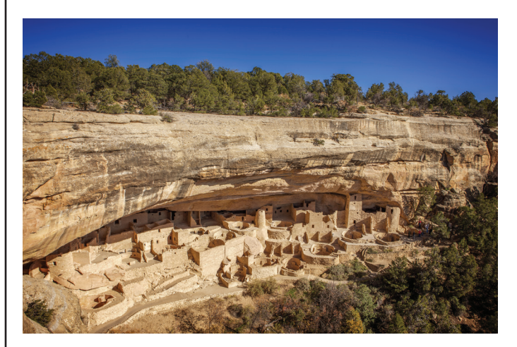
Mesa Verde in Colorado is an example of Pueblo architecture.

<sup>45</sup>The Northwest Coast tribes relied heavily on salmon, shellfish, berries, and camas root to provide their foods. 46Tribes were made up of villages built along the ocean shore or the edge of a bay or river. 47 Native homes along the coast were planked (long, flat timbers) longhouses. <sup>48</sup>They also used local forests to gather materials for woven mats, baskets, canoes, and other wood products. 49Inland from the coast, east of the Cascade Mountains, were the Plateau tribes. 50Like the Great Basin and Plains tribe. Plateau tribes were nomadic, moving with the seasons. 51Annual salmon runs up the Columbia River into the interior plateau region provided a major source of food. <sup>52</sup>Plateau tribes traded widely with the Northwest Coast tribes and the Plains tribes.