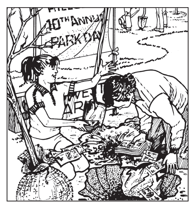
During the city's park restoration and cleanup day, students from Blach High School uncovered a plastic bag containing $50,000. Police theorize that the money was stolen from a bank twenty years ago.

The students who recovered the treasure, nearly $5,000, are hoping the bank will offer them a reward for there honesty. "I've never seen so much money in my life," said one of the young men, but I certainly wouldn't have any problem thinking of ways to spending it. Who says money doesn't grow on trees? he added. Bank Officers were not available for